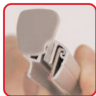
Universal gripper/ self-adhesive top rail

The 33" excalibur is a premium, double sided banner stand with a sleek new design, graphic tensioner, integrated pole storage and quick change graphic system. Comes complete with a telescopic pole and EVA molded carrying storage bag. The EXCALIBUR is 33" wide x 87" high with a weight of 13lbs for ease transport.