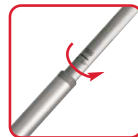
Telescopic Pole (Twist & Lock)