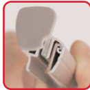
Universal grippal/ self-adhesive top rail

The 33" BARRACUDA is a premium, single-sided roller banner. Features include a graphic tensioner, quick change graphic system and telescopic pole (which conveniently stores in the base of the unit). EVA molded carrying/storage bag is included. This single sided roller banner has been specially designed for maximum convenience with dimensions of 33" wide x 87" high and a weight of 9.92lbs for ease of transport.